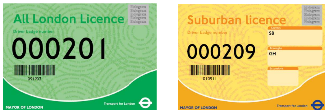
Figure 3 – Taxi driver identifiers

Due to the wide-ranging combination of licence areas for suburban drivers, this information is set out in codes rather than listing the specific areas by name. These codes and some examples of combinations can be found at Appendix G .