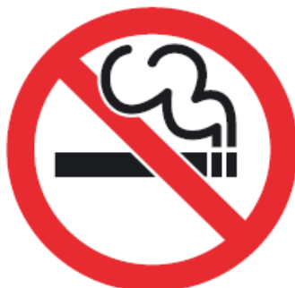
Figure 9 – Sample 'No Smoking' sign

Drivers or passengers found to be smoking in a licensed taxi or PHV may be subject to a fixed penalty notice of £50, or a maximum fine of £200 if prosecuted and convicted by a court.