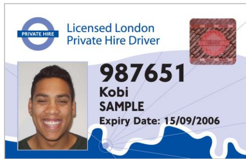
Figure 5 - PHV driver's badge

A written warning will be the norm for a first offence in the period of the current and preceding licence. Unless there is significant mitigation, further offences in the same period will result in the suspension or revocation of the driver's licence.