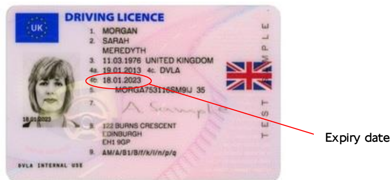
Figure 6 – Sample DVLA photocard

DVLA photocard are valid for 10 years after which they must be renewed. The expiry date is shown at 4b on a photocard.